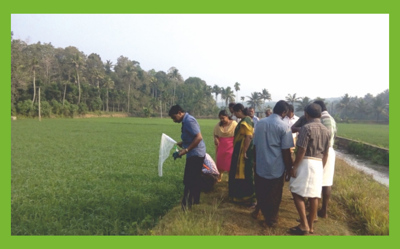
Farm School – Activities