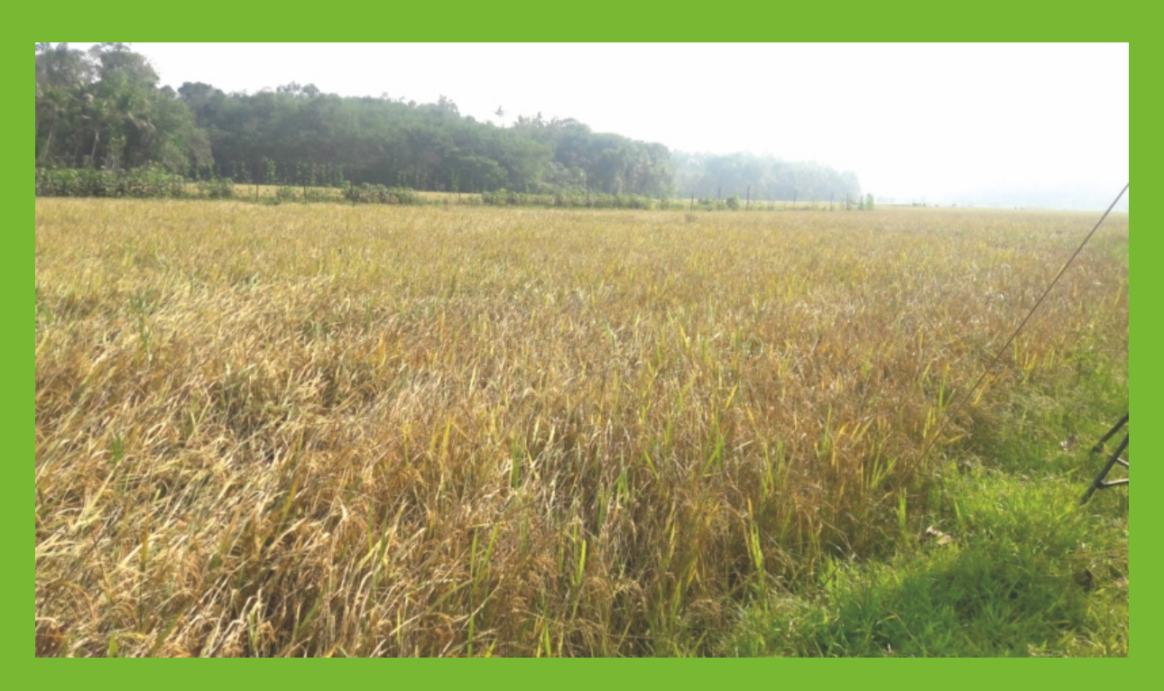
Crop Ready for Harvest