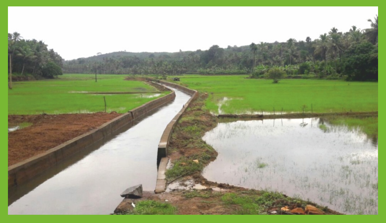
Field after 1 Month