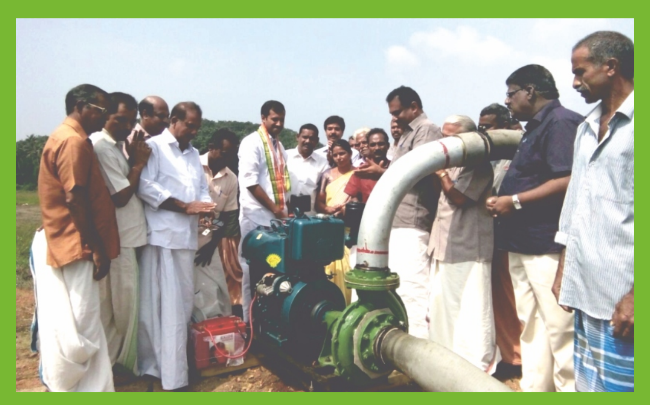
Installed 20 HP pump set under ATMA scheme during 2016-17 for a cost of 2.25 lakhs