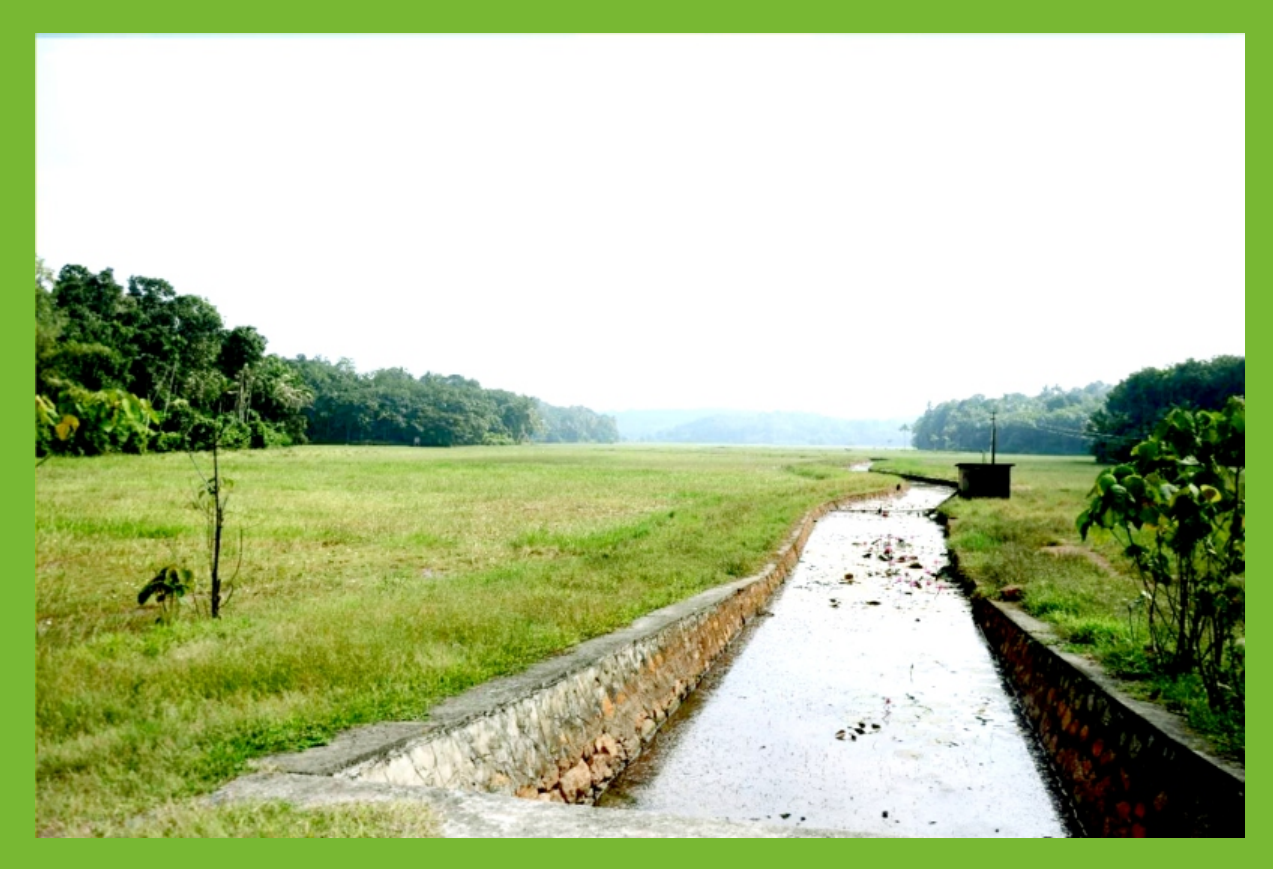
UNCULTIVATED FIELDS DURING 2014-15